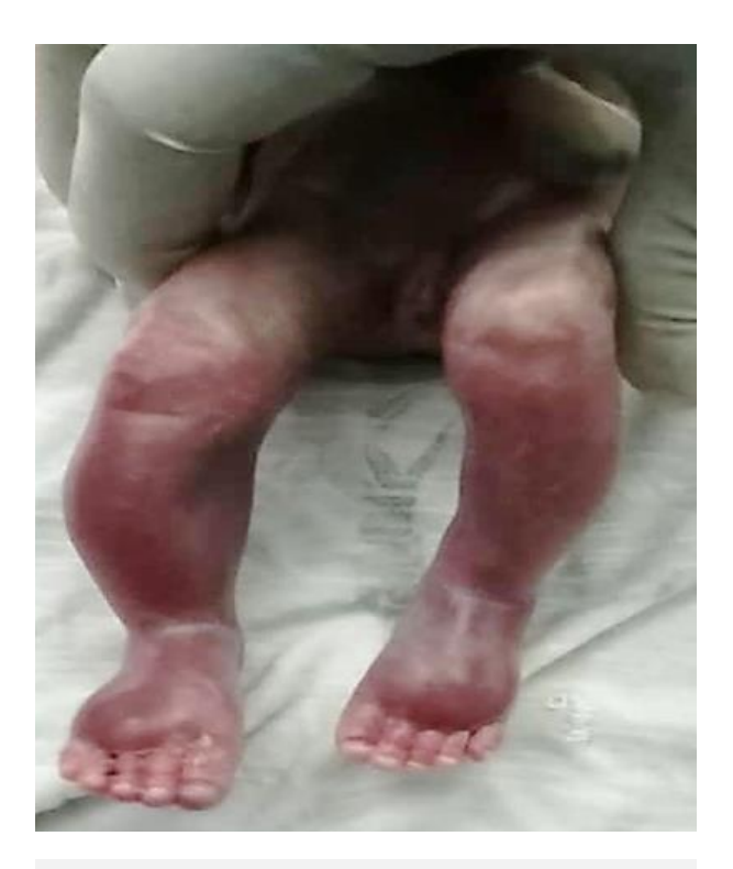
Figure 3. Macroscopic study of the lower limbs with evident bilateral edema at the level of the legs and feet

Informed consent (written and verbal) was obtained from the couple to publish the case. The principles of the World Medical Association's Code of Ethics (Declaration of Helsinki) for human experiments were adhered to.